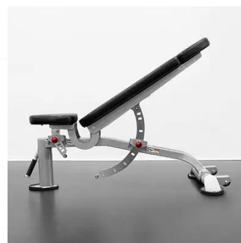
Laser-cut 3x3" Rolled Steel Oval Tubing Bolt-together construction with durable coat finish supports lifetime usage.