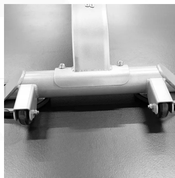
TPR Handle Allows for easy transport