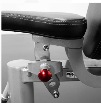
5 Level Adjustment Seat System