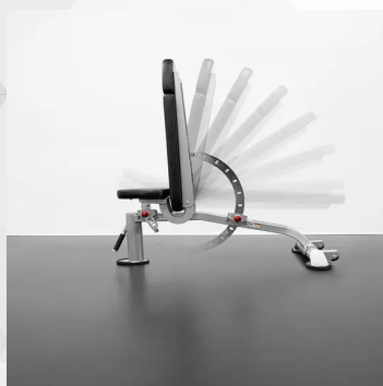
8-Position Back Pad Offers a Customizable Workout. Flat, Decline and Incline Positions