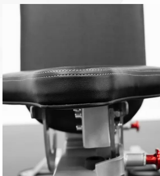
Comfortable High Density Foam Seat and Back Padding With reinforced double stitched seams