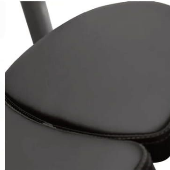
Ergonomic Headrest For head and neck comfort