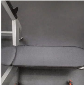
Thick Wide Pad for Back and Trunk Support