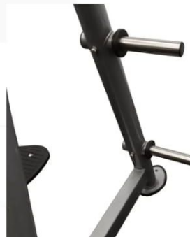
4 Weight Plate Storage Pegs