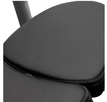
Ergonomic Headrest For head and neck comfort