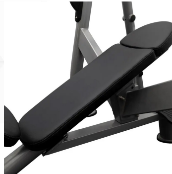
45 Degree Position For optimal upper chest targeting