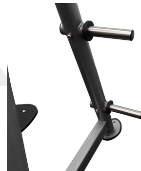
4 Weight Plate Storage Pegs