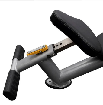
Adjustable Seat Height 6 Adjustment points