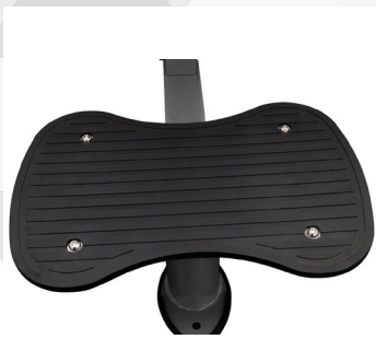
Spotter Platform with Rubber Grip Padding For safety