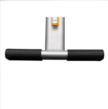
Foot Rest For stability during the exercise