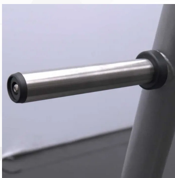
Stainless Steel Weight Plate Pegs