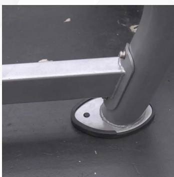
Rubber Feet To protect user's flooring.