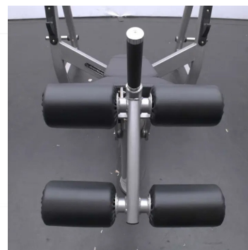
Foam Leg Roller For stability