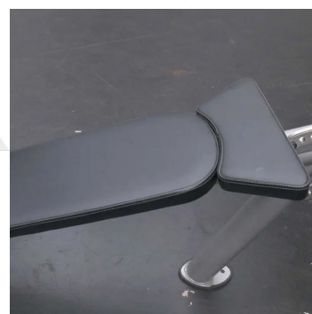
The Wear-Resistant Seats are made with High-Density Foam To provide you with comfort and stability