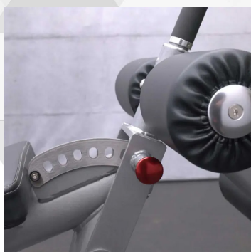
Adjustable Bench Angles