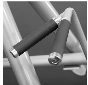
Multiple Grip Positions (Narrow/Wide) For exercise variation