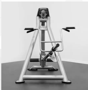
11-Gauge Steel Mainframe Plate Loading Design Frame is protected by a durable powder coat finish