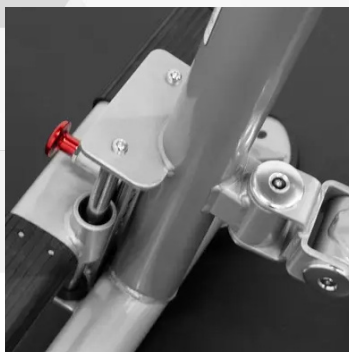
Chest Pad and Foot Plates Secure upper torso to isolate lats/rear deltoids