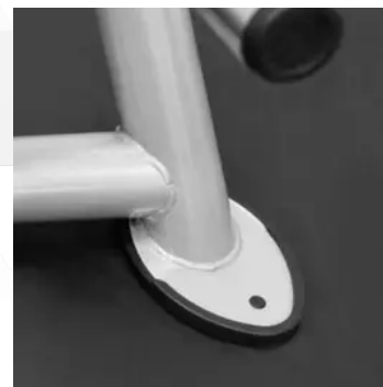
Rubber End Caps To protect flooring