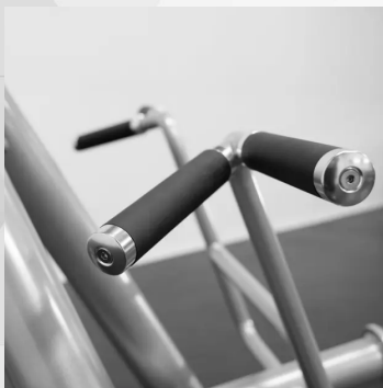
Dual Polyurethane Covered Steel Handles For variety and added longevity