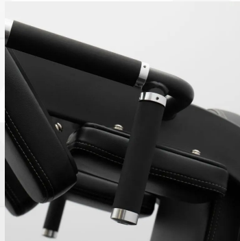
Multiple Durable Urethane Composite Hand Grip Positions To hold during use