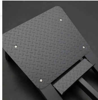
Large Footplate For isolating different leg and glute muscles