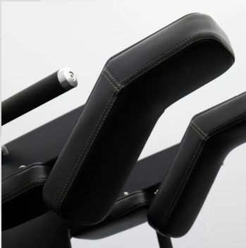
Angled Pads Allows for 3 Different Squat Positions