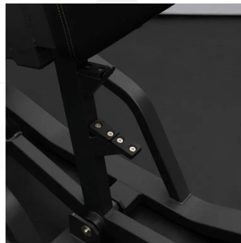
3 Safety Locking Points Allowing users of any height to start at their desired position