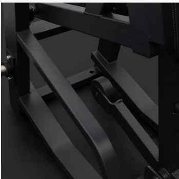
11 Gauge Steel Construction