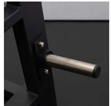
2 Weight Loading Pegs and 2 Plate Storing Pegs