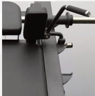
2 Safety Locking Points With easy to reach and operate safety stops