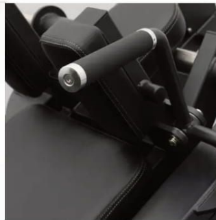
Integrated Rubber Handles For safe entry and exit