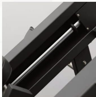
Linear Bearing Guide Rods Resist rust and provide smooth carriage operation