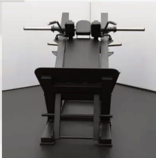
11 Gauge Steel Construction