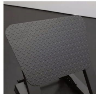
Large Non-Slip Foot Plate Allows user to define proper foot placement