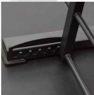
6 Position Adjustable Angle On foot plate to suit every user