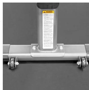
Wheels Enable Easy Movement