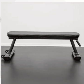
Pair of Angled, Wide-Set Legs For Maximum Stability