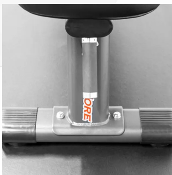
Handle Provides Easy Transport