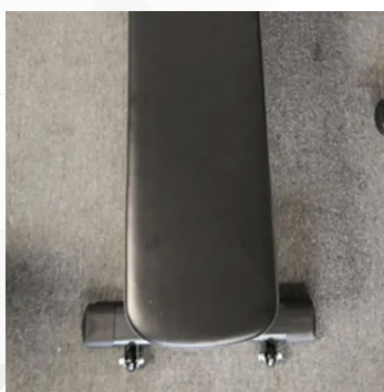
Comfortable Padding Constructed of dense open cell foam and covered in marine-grade, stain resistant vinyl