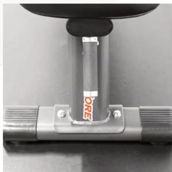
Handle Provides Easy Transport