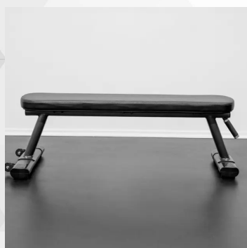
Pair of Angled, Wide-Set Legs For Maximum Stability