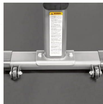
Wheels Enable Easy Movement