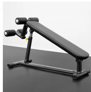
Longer/Wider Backrest For Added Comfort