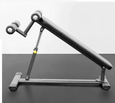
Durable Construction With powder coat exterior finish to protect against wear and tear