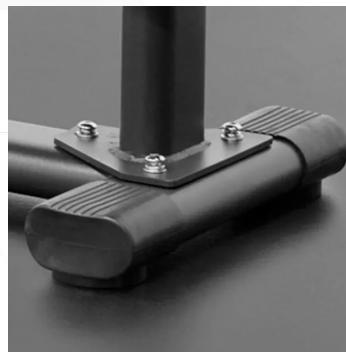
Rubber End Caps and Feet Added to protect flooring