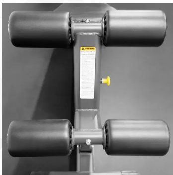
Heavy Padded 2 Level Rollers