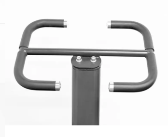
Padded Handlebars Allows you to control the intensity and duration of each stretch