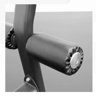
Seat Pad and Foam Rollers Provide comfort and stability for correct positioning in seated stretches