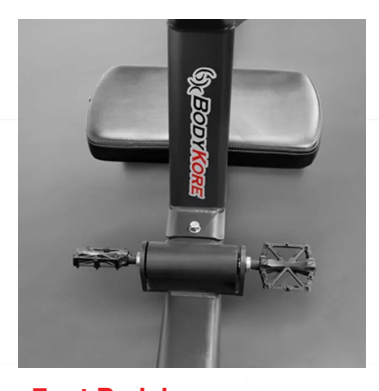
Foot Pedals Provides comfortable and effective leg stabilization for both seated and standing stretches