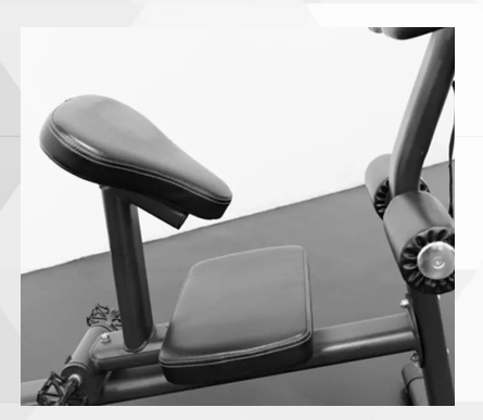
Unique Seated Design Helps stabilize your back during stretching movements