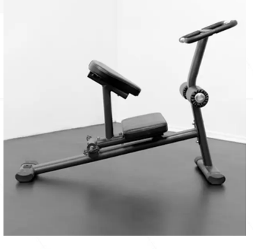
Powder-Coated Steel Frame With reinforced post and elongated base