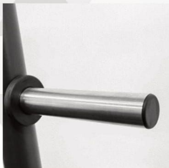
8 Olympic Plate Storage Pegs

Store a plethora of Olympic plates with these plate holder bars attached to the rack