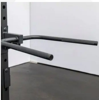
Add on: Removeable Dip Bar Attachment This easily removeable dip bar attachment allows you to do dips and other bodyweight exercises with the rack