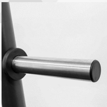
8 Olympic Plate Storage Pegs Store a plethora of Olympic plates with these plate holder bars attached to the rack