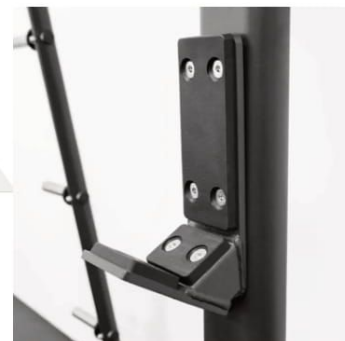
Add on: Reversible J Hooks

This easily removeable dip bar attachment allows you to do dips and other bodyweight exercises with the rack