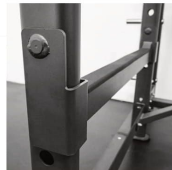
Safety Spotter Arms Eliminate the need for a spotter with these safety arms.