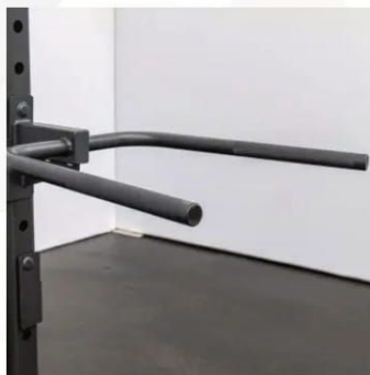
Add on: Removeable Dip Bar Attachment

Store a plethora of Olympic plates with these plate holder bars attached to the rack