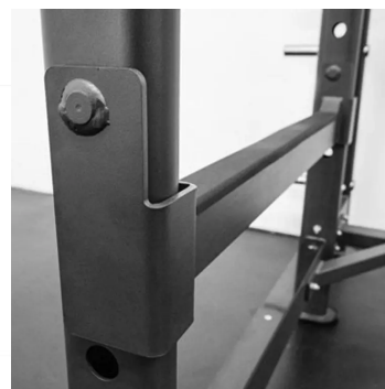
Safety Spotter Arms Eliminate the need for a spotter with these safety arms.