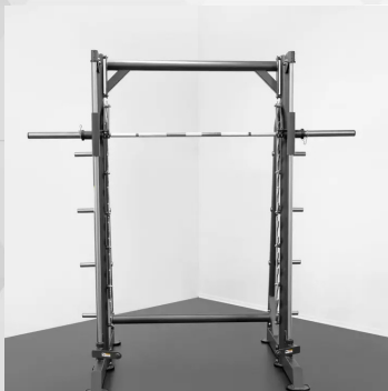
Frame Made with 3.5" Oval Rolled Steel Tubing - Rated over 1000lbs