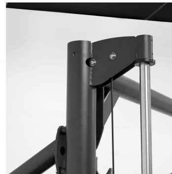
Solid Guide Rails for Smooth, Consistent Movement