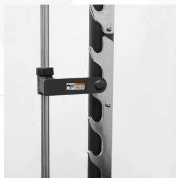
Safety Spotters With 13 height mounting positions