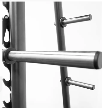
Counter Balanced Smith Bar On Dual Pulley System