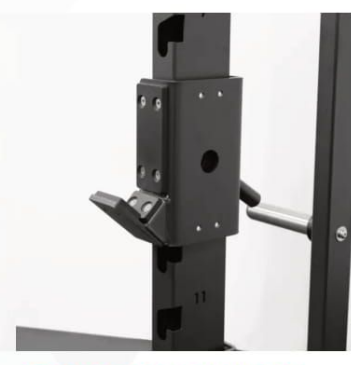
Dual Position J Hooks