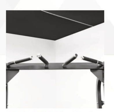
Multiple Grip Position For Pull Up Bar