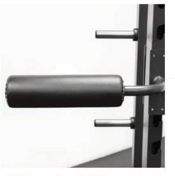
Add-on Available Dip bar, land mine, band peg, and foam roller attachments