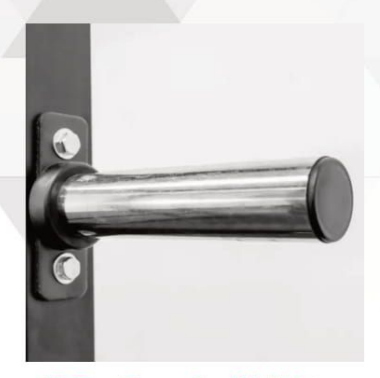
10 Bar Pegs for Weight Storage