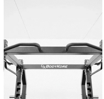
Multi-Grip Position Pull Up Bar