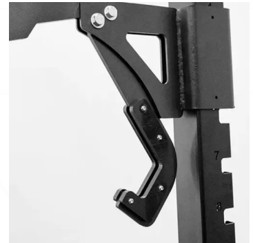
Optional Add On: Monolifts