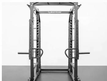
Optional add on: Jammer Arms