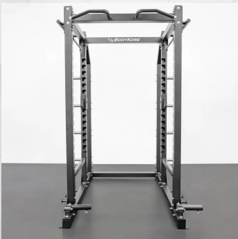
Frame built with 3"x3" Steel Tubing