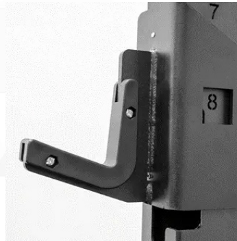
Optional Add On: J Hooks