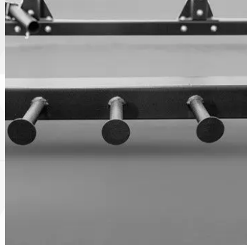
Multiple Band Peg Placement