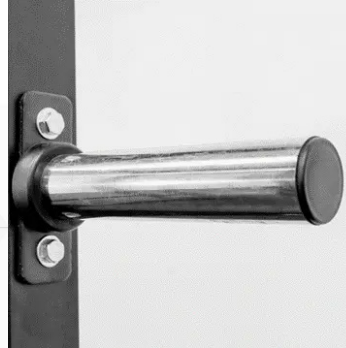
8 Peg Weight Storage