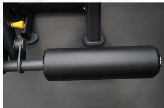
Thick Padding For comfortability.