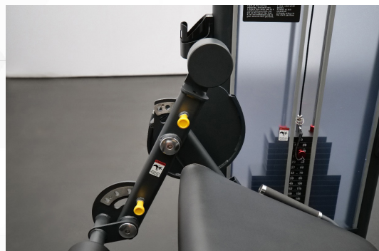
Adjustable Arms For starting position and leg length.