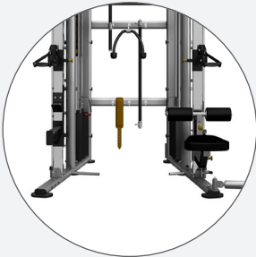
The Dual's Adjustable Pulley System comes with 2x220lbs stack weights and storage hooks for the pulley attachments.