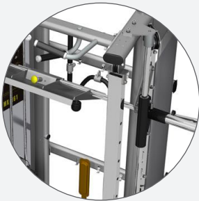
The inverted leg press add-on attachment allows the users to use the smith bar for inverted less presses.