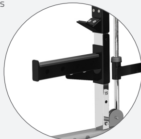
Safety spotter attachment for Olympic bars.