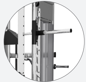
The dual balanced smith machine spotters make the Universal trainer a safety first training system