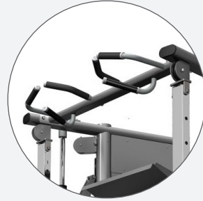
Multi-Grip pull up handles to target different areas of the back