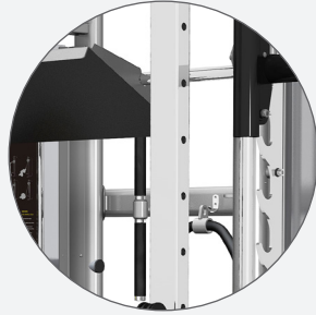
Laser cut holes and numbers made with precision.