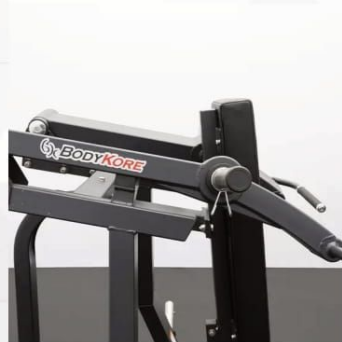
Electrostatic Powder Coat Finish Ensure maximum adhesion and durability