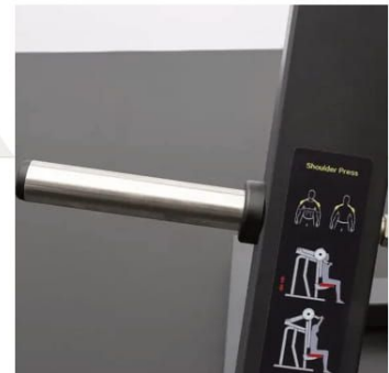
Nickel-Plated Weight Plate Storage and Loading Bars