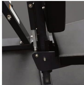
Industrial Rated Bearings and Sealed Bearings