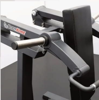
11-Gauge Steel Frame Has 2" x 4" oval tubing