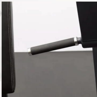
Heavy Duty Foam Grips