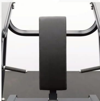
Ergonomic Backseat Design