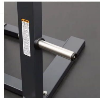
Nickel-Plated Weight Plate Storage Bars