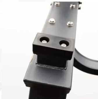
Commercial Rated Precision Pivot Bearings