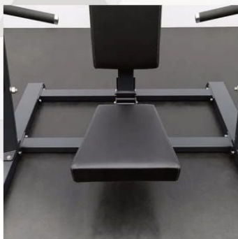
Adjustable, Padded Seat