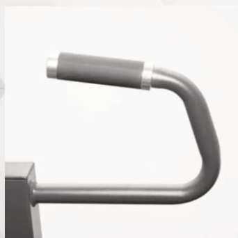
Urethane Covered Handles For stability