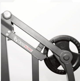
Electrostatic Powder Coat Finish To ensure maximum adhesion and durability