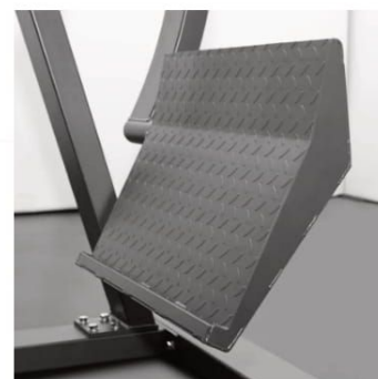
Large Non-Slip Foot Plate