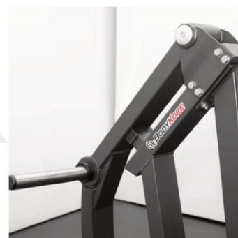
11-Gauge Steel Construction