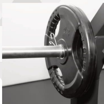
Weight Loading Peg